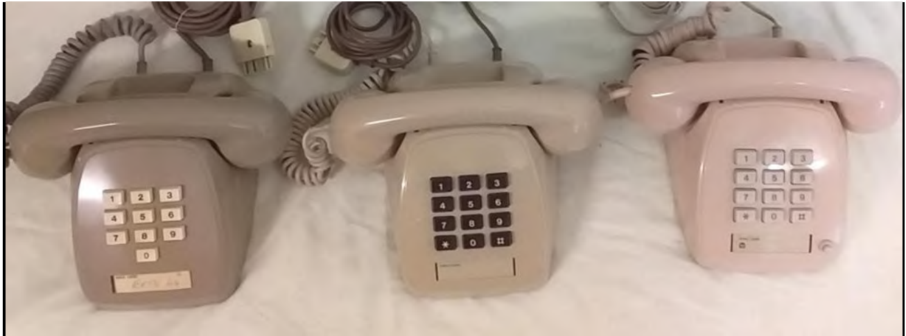
L-R: 805 Touchfone 10, 805-806 Touchfone 12 and 807-809 Touchfone 12

electronics and keypads similar to the 807-809. Model 897 was the decadic version and 898 the DTMF.