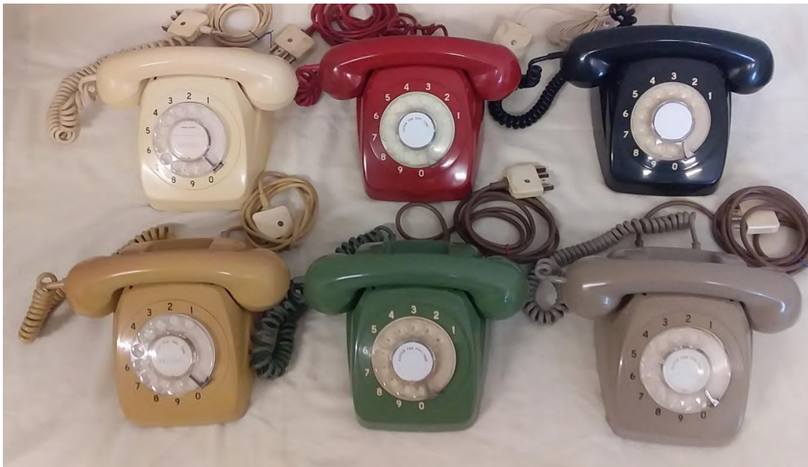
Various 801 telephones showing the colour range and some different dials

Aimed at the brighter 1960s Australian domestic décor, the initial colours were; light ivory, mist grey, fern green, topaz yellow and lacquer red. Black was added to the range later in 1964.