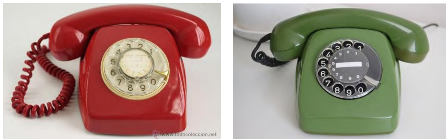
L-R 1960s Spain “Heraldo” telephone, Germany FeTAp 61