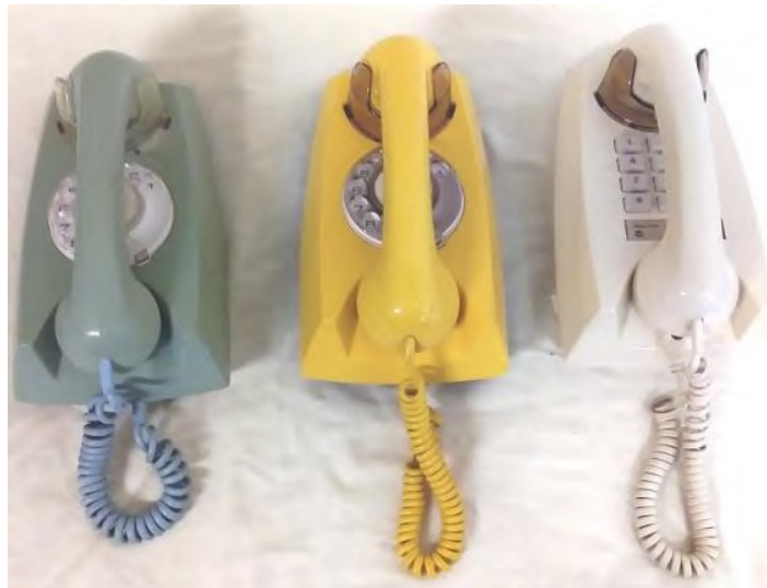
L-R Wallfones 891 (1972), 891 (1976) and pushbutton 897-898 (1985)

1972 saw the introduction of the equivalent model 891 wall telephone, the “ Automatic WallFone ”. Initially the 891 was supplied in the colours; black, appliance white and powder blue. In 1976, the colours ebony brown, beige and maize yellow were added to the range. Also, the transparent dial finger plate and handset cradle were tinted from this time. In the mid-1980s, pushbutton versions 897/898 were introduced (discussed below in “ Touchfone ”).