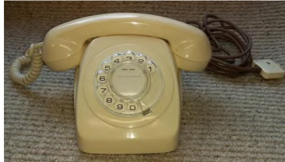
1970s 802 telephone

1971 saw the release of the 802 “ Automatic Colorfone ”. This was fitted with the Australian made dial, DMS-2, which was similar to the DMS-1 except it had numbers, instead of arrows, printed on the dial plate. The 802 telephone was almost identical to the 801 except for the dial and lack of adaptor ring. The colour range was the same. A small batch of imported dials was also used in the 802 in the early 1970s and an updated DMS-3 dial appeared near the end of production in the early 1980s.