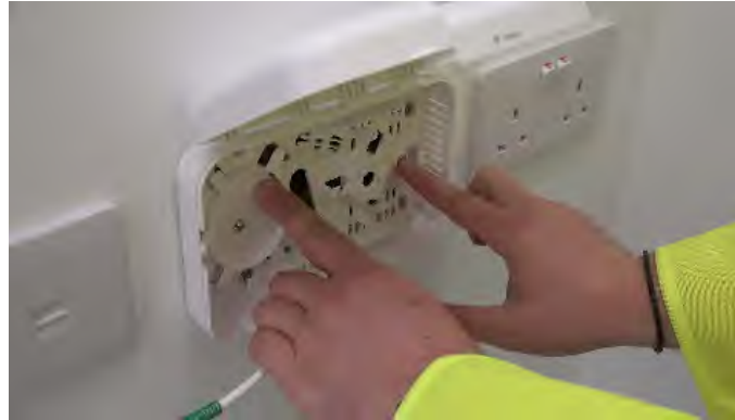
Attaching horizontally to a double back box