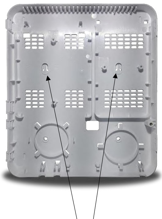
Screw fixing positions