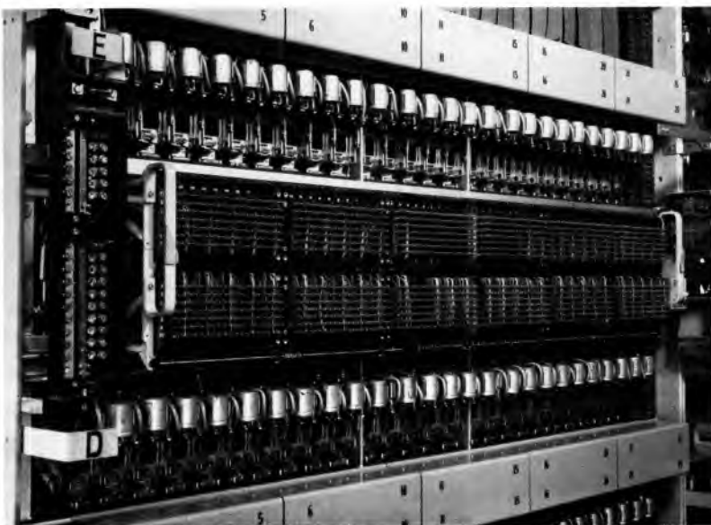
Below, Right : Rear view of the rack, showing the covers in position.