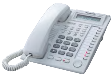
■ KX-T7730 LCD, Speakerphone Unit